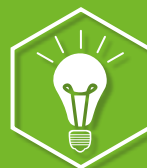
CREATIVITY & INNOVATION